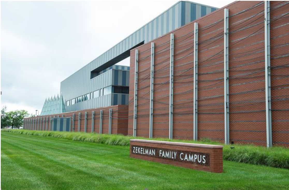
Holocaust Memorial Center

The Holocaust Memorial Center's Zekelman Family Campus.